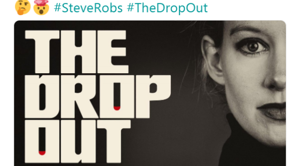
5:14 AM - 1 Mar 2019